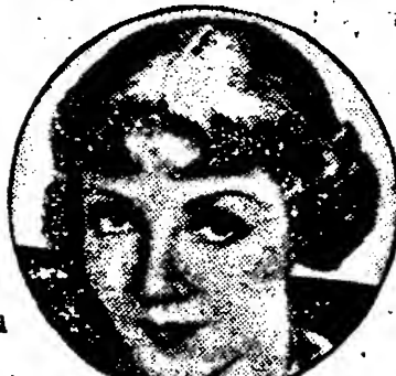
CLAUDETTE COLBERT Guest of Honor